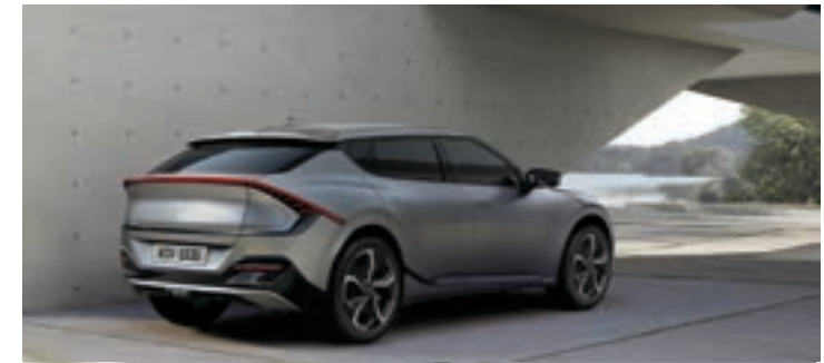
Electric Global Modular Platform