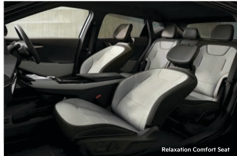
Relaxation Comfort Seat