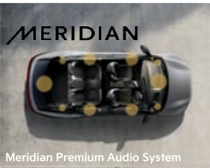
Meridian Premium Audio System